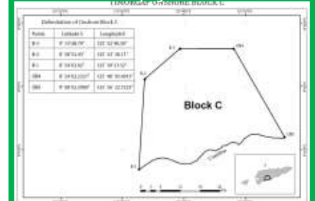
Block C - Betano with an area of 1004.01 km 2 .