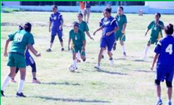
Australian Embassy female Team (with blue uniform) and the TIMOR GAP's Team (with green uniform)