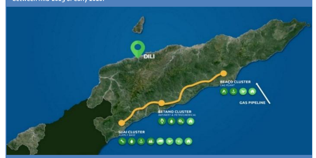
TASI MANE - A FUTURE TO PERFORM

The land and title identification and acquisition process for Phase II of the highway project (section 2: Fatucai/Mola – Betano_34.3km) is assumed to commence in 2019 and the construction commencement between mid-2019 or early 2020.