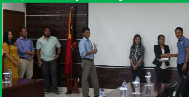
The two TIMOR GAP staff have been contemplated with a special ceremony where most of the company colleagues participated.