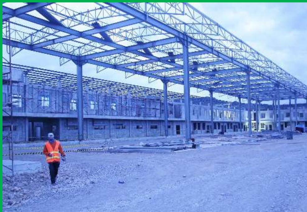
Suai airport under construction – Helicopters hangar