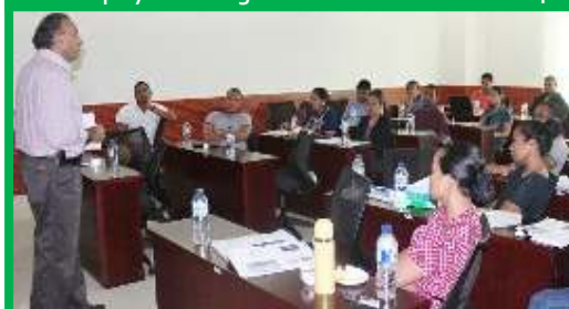
Internal Audit Training - 2015