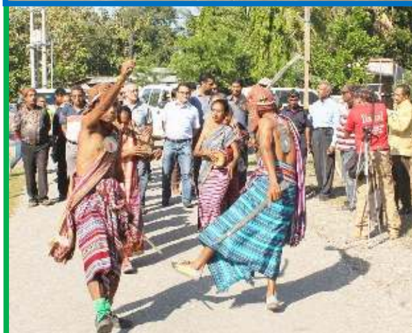
Community welcome the Inter-Ministerial Team