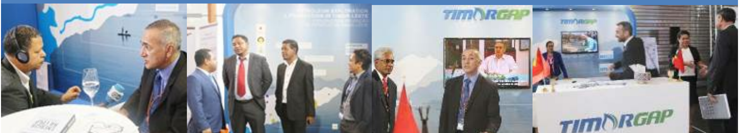
H.E. Minister of Petroleum and Mineral Resources, Mr. Pires being interview by CPLP Media

Also important to mention that during this CPLP Conference it was included an expression of solidarity with Timor-Leste regarding the settlement of maritime borders noting the CPLP’s expectation “that the maritime border demarcation between Timor-Leste and Australia should be in accordance with the principles of international law and the United Nations Convention on the Law of the Sea.”