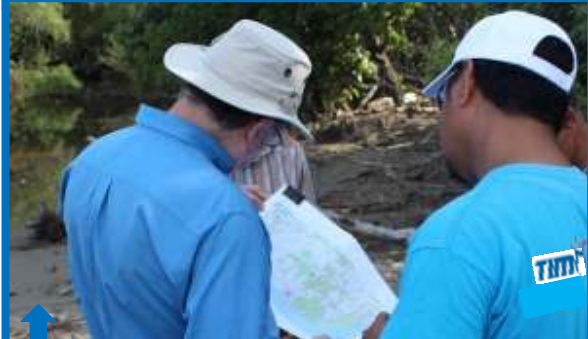
Identifying sites for potential sources of fresh water supply for the future Timor-Leste LNG Plant