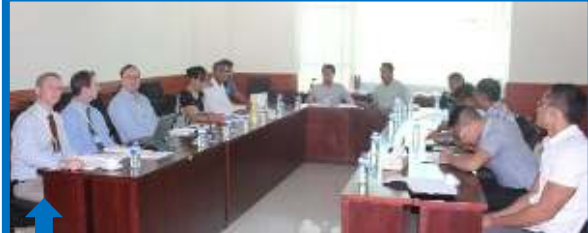
Meeting between TIMOR GAP and AMEC Foster Wheeler (AFW)