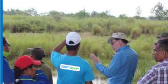
Monara stream within the designated area for future Timor-Leste LNG Plant