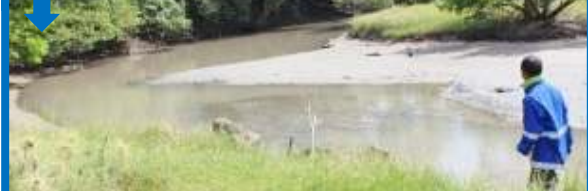
Site visit team comprising both TIMOR GAP & Amec Foster Wheeler member