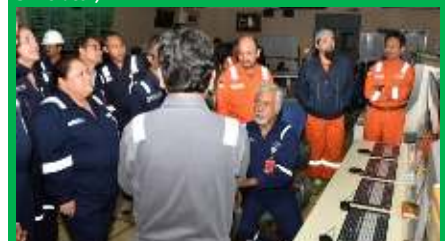
Plant visit Control Room Module 2