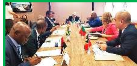
II Meeting of CPLP Focal Points for Energy