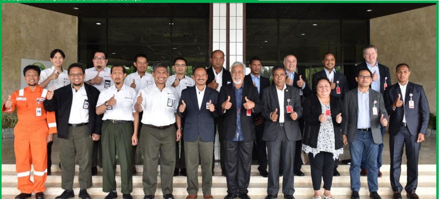
Photo session with the Management of Badak LNG