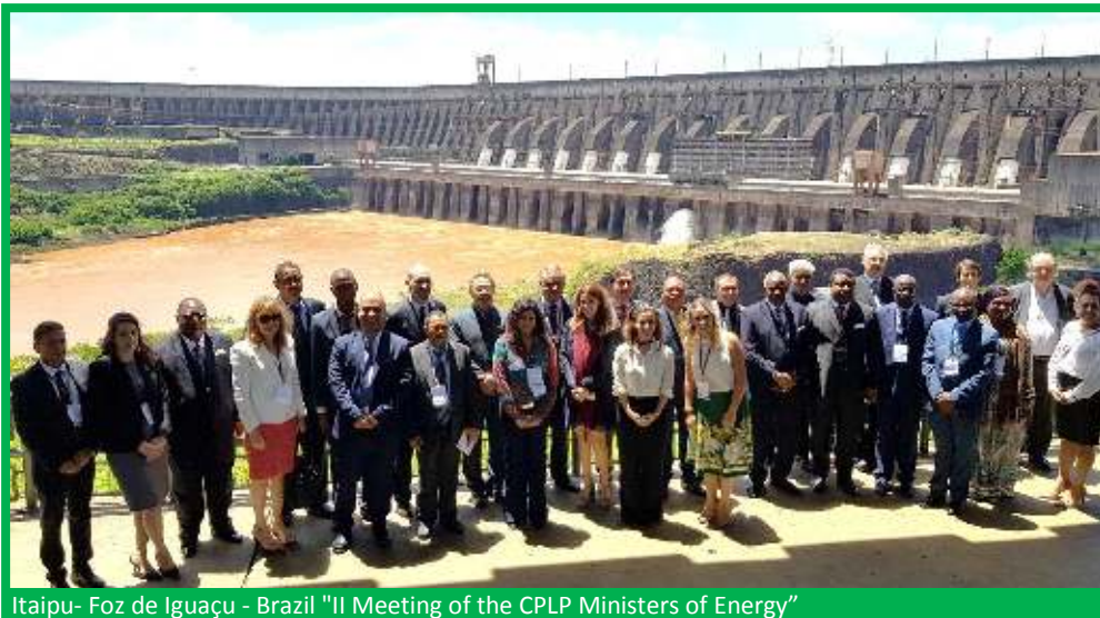
Itaipu- Foz de Iguacu - Brazil "II Meeting of the CPLP Ministers of Energy"