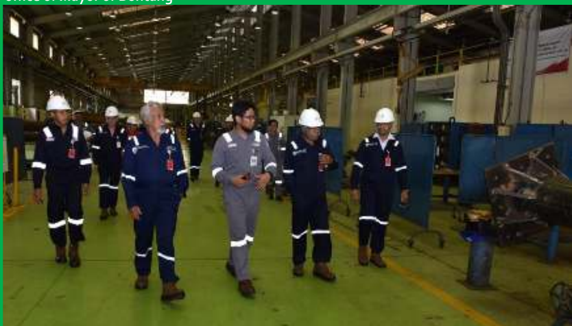
Delegation touring one of the Maintenance shops