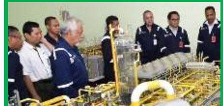
Delegation introduced to the whole liquefaction process through an OTS (Operator Training Simulator)