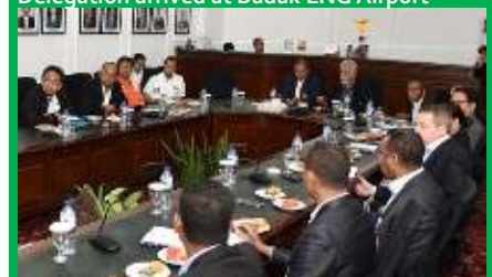
Courtesy Meeting with Management of Badak LNG