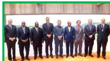
II Meeting of CPLP Ministers for Energy