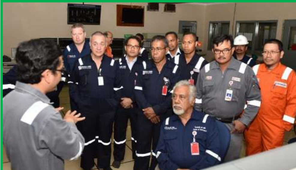
Delegation being briefed at one of the Control Rooms