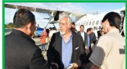
Delegation arrived at Badak LNG Airport

Following the courtesy meeting, His Excellency and the Delegation was escorted for a plant tour in order to observe the operations and maintenance of Badak’s eight (8) LNG trains, all of which run by Indonesian nationals. From control room, the tour was continued to LNG loading jetties, LNG maintenance workshop and finally to the LNG Learning Center – home to the LNG academy as well as the center in which many LNG Companies from Asia to Africa and to America have had their technicians successfully undergone LNG training over the course of the last decade. It was also the center from which two (2) of TIMOR GAP’s Engineers received their first OPITO certificates following the completion of intensive On-Job-Training (OJT) on LNG Operations and Maintenance between 2015 and 2016.